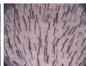
Figure 2. 2. subject 17, T 3 months, lotion 0.5%.