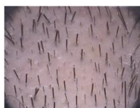
Figure 2. 1. subject 17, T 0, lotion 0.5%.

(Lotion containing 0.5% essential oil prevents hair loss)